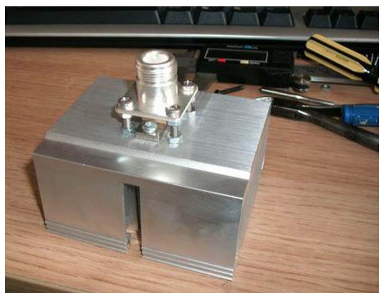
Fig 1 – Completed Dummy Load with flange-resistor and N-connector installed on Heat Sink, but no fan.

I started by purchasing a 50ohm 250W thick-film resistor. The flange-mount resistor I chose from Anaren has a specification (see data sheet in Figure 5 ) that will enable it to be used up to at least 2GHz, and cost £7. I have seen some on eBay for about the same price, but only 150W versions. The Henry Radio eBay store does sell 250W units manufactured by Res-Net Microwave for about US$26 in quantities of one (including free shipping inside US).