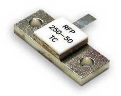
Fig 2 – 50 ohm Flange-Mounted-Termination Thick-film resistors available from Res-Net Microwave and Aranen

flange applying a liberal dosage of heat transfer compound. I folded the resistor TAB back over onto the top of the resistor body. I also modified an "N" type of connector receptacle, filing the centre pin on the bottom down as much as possible. The connector is mounted centered over the resistor tab and the connector pin makes a compression electrical contact with the resistor tab, using the mounting four mounting bolts. Be careful not to over tighten the compression or you will break the resistor.