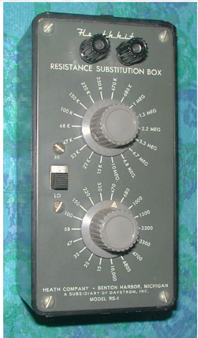
Figure 1: Heathkit RS-1 Resistance Substitution Box shown set for 470 ohms

A Resistor Substitution Box is just a simple piece of test equipment with two terminals that allows the user to select one of numerous values of resistors. These resistors are usually 5% or 10% tolerance. Since resistors tend to in-