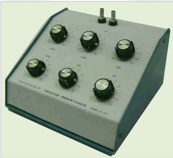
Figure 3: Heathkit IN-3117 Resistance Decade Box

tion selects two values. A slide switch on the lower part of the panel determines which of the two values is used. I was not able to determine if the 36 values of resistance available in these boxes are the same as the RS-1? However, that is the likely case.