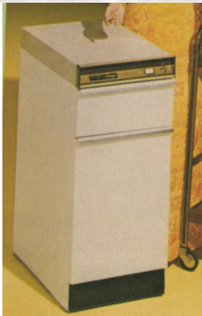
Figure 1: Heathkit GU-1800 Trash Compactor

Heathkit introduced the GU-1800 in late 1971, see Figure 1. An ad appeared in the October issue of Popular Science of that year announcing