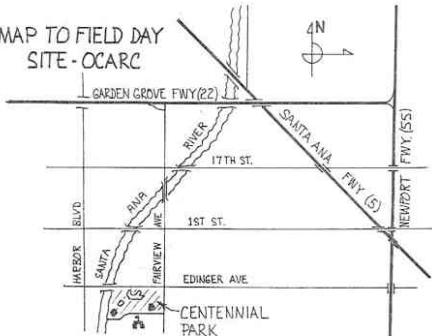
MAP TO FIELD DAY SITE - OCARC

To make this an enjoyable event and to prepare ourselves incase a distaster comes our way, everyone should try to participate to as large an extent as possible. Please come out even if you can stay only for awhile, but feel free to stay as long as you