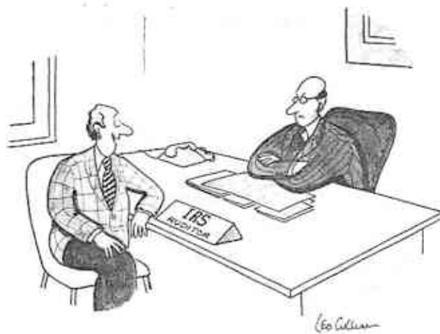
"The solar tax credit won't let me take a depreciation on the sunspots?"