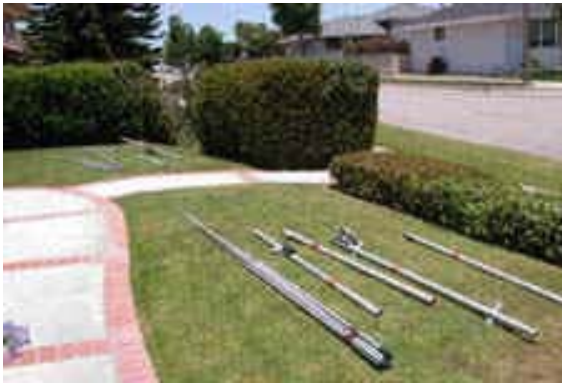
Field Day actually begins about a week before the event as inspection and repairs are made to some of club equipment. Here the 15M and 20M mono-band beams are inspected and repaired at the QTH of Ken-W6HHC.