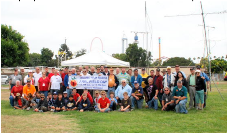
OCARC 2013 Field Day Group placed 2nd overall with 6,859 QSOs

The club has technically oriented members who can help you with your radio problems and questions. It also has people familiar with Mac and Windows computers.