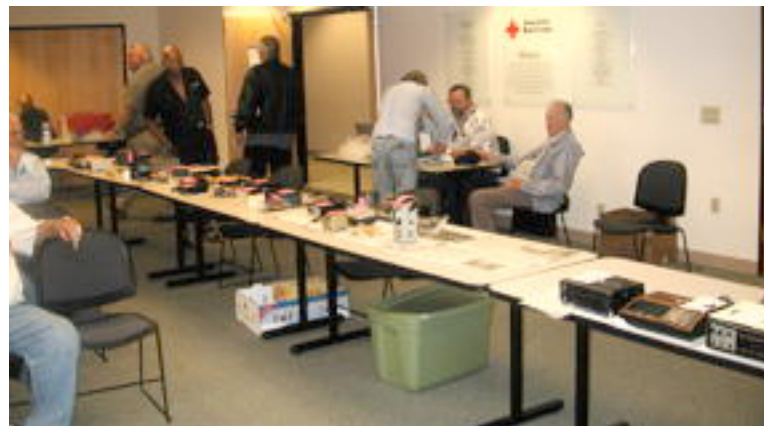
Just part of the items for auction at the annual October auction.

In October the club holds an open auction for selling and buying amateur radio and amateur radio related items: