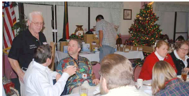
Our annual Holiday dinner and party.

In December there is the yearly club Holiday Dinner Party :