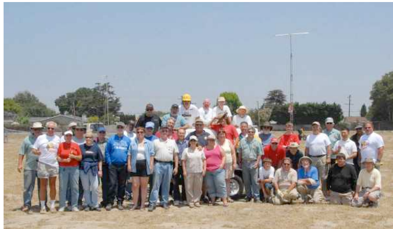
OCARC 2007 Field Day Group placed 2nd overall with 6,217 QSOs

The club has technically oriented members who can help you with your radio problems and questions. It also has people familiar with Mac and Windows computers.