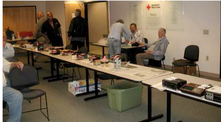
Just part of the items for auction at the annual October auction.

In October the club holds an open auction for selling and buying amateur radio and amateur radio related items: