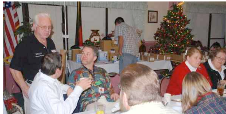
Our annual Christmas dinner and party.

In December there is the yearly club Christmas Dinner :