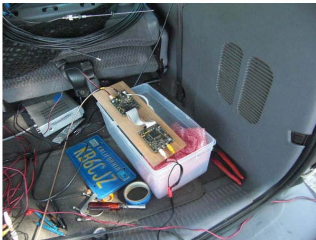
Figure 1 – DATV DVB-S 1 mW Transmitter for 1.2 GHz