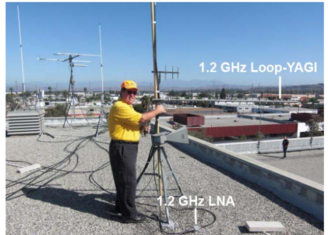
Figure 3 – Robbie KB6CJZ Adjusts RCVR Loop-Yagi

We did not have enough time to complete testing of the RF Power Amps, so the RACES testing of DATV was “jerry-rigged” using a portable 1 mWatt DVB-S transmitter that is shown in Fig 1 and Fig 2 , This D-ATV transmitter was more fully described last month in TechTalk 77 article (see www.W6ZE.org/DATV ). The portable DATV transmitting station used a 20-element 1.2 GHz yagi antenna.