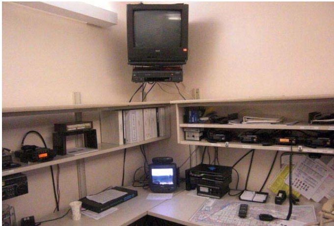
Figure 4 – Inside COAR RACES Radio Room

Fig 4 shows some of the radios and displays inside the OPD COAR RACES Radio Room. The lower display is an analog TV that shows the received DATV video directly. The larger display is also an analog TV that is connected to the network of video displays in the nearby City of Orange EOC room.