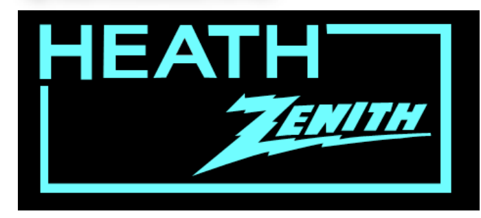
Another April Heathkit Article: