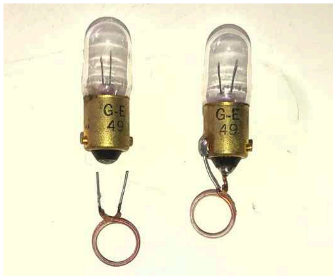
Figure 4: Dummy load used on my GW-31 units.

Of special interest is the dummy load. My kits each came with a coil that you soldered to a #49 lamp bulb ( Figure 4 ). The coil was placed near the transmitter tank and used to