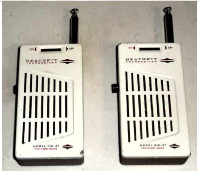
Figure 1: A pair of GW-31 Hand-held CB Transceivers.

http://www.w6ze.org/Heathkit/Heathkit_Index.html