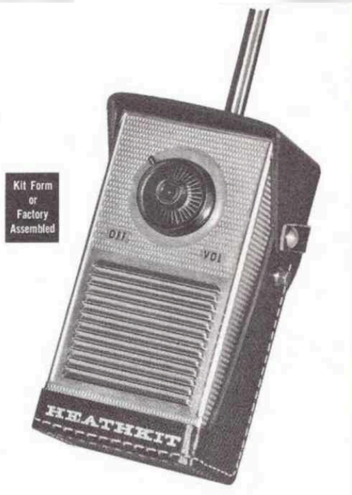
Figure 2: GW-30 Heathkit's first CB Walkie Talkie

also acts as the microphone). Audio output is 30 mW. The GW-30 has just two external controls; a large black volume control, with an OFF - ON switch at its fully counter-clockwise position and a "Push-to-talk" (PTT) button. "Set and forget" receiver regeneration control and receiver oscillator adjustable coil are not accessible for adjustment when installed in the case. The pull-out whip antenna extends to 40" and collapses to 7-1/2".