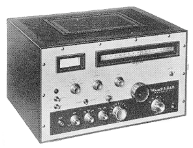
Heathkit TX-1 Apache AM/CW Transmitter (Operates SSB with SB-10 SSB Adapter)

As you know from my earlier articles, Heathkit, in the late 50's and early 60's, liked to name their ham equipment after American Indian tribes. The TX-1 Apache is one of these ham kits.