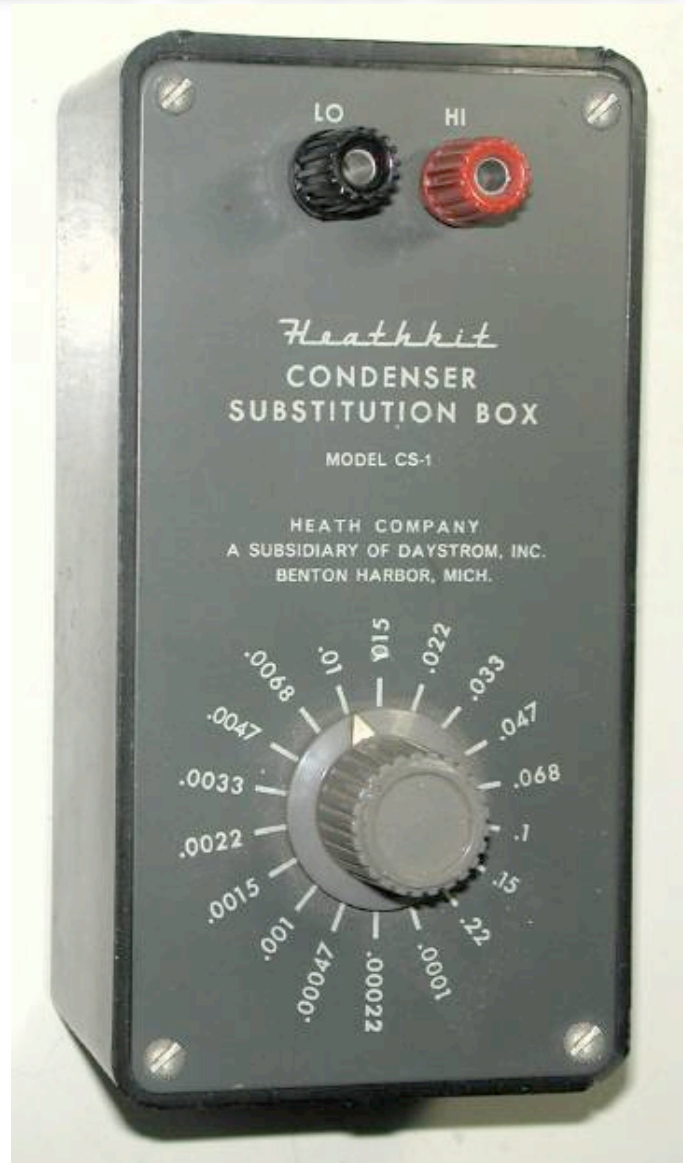
Figure 1: Heathkit CS-1 Condenser Substitution Box set for 0.01 \mu\text{F}

Prior to the mid-sixties “capacitors” were known as “condensers”. The name change occurred because engineers and scientists decided that “capacitor” was more descriptive;