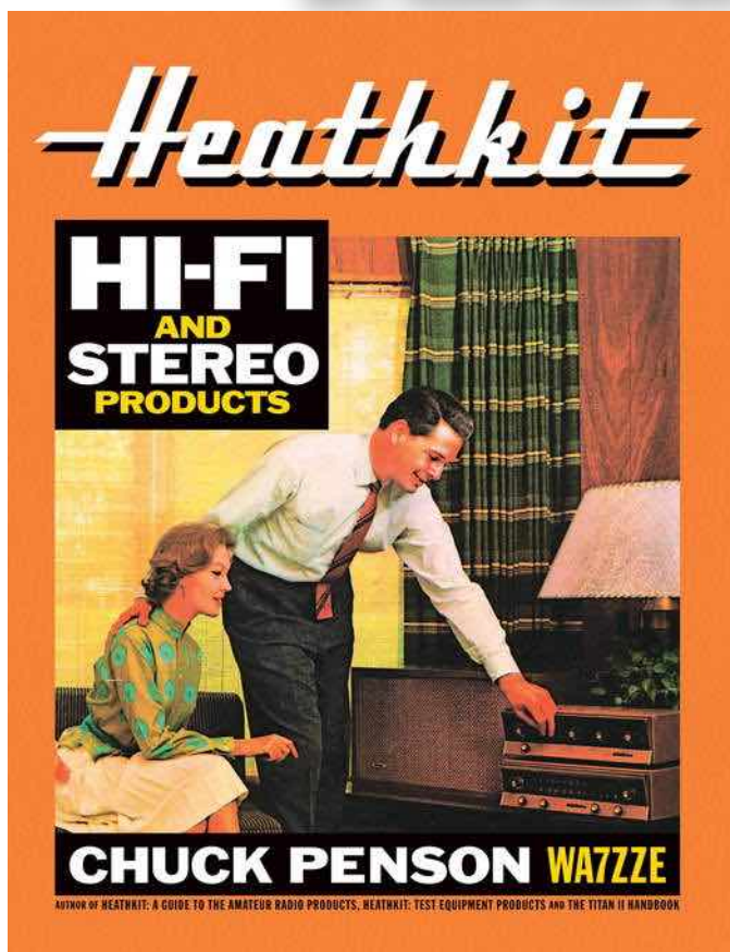
Figure 1: Book Front Cover (Photo from the front cover of the Fall-Winter 1961-62 Heath Catalog)

http://www.w6ze.org/Heathkit/Heathkit_Index.html