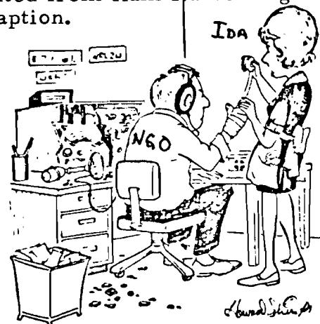
How many times have I told you, Kei, to stop drawing arcs off your finals with a pencil.