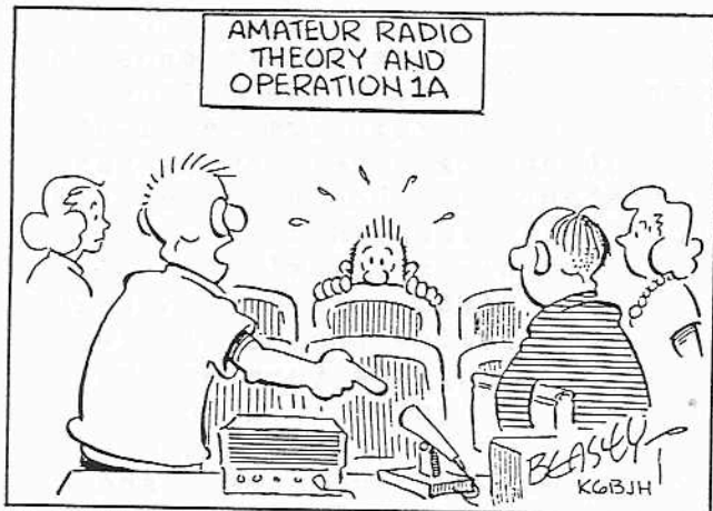
REMEMBER WHAT WE LEARNED IN CLASS LAST WEEK, DESMOND? WE HAVE TO BE CLOSE TO THE MICROPHONE

If you hve an unmarked 120 V light bulb and would like to know its wattage, measure its resistance (cold) and divide into 1000. The result should get you into the ball park, wattage wise. Example: 100 W should show 10 ohms, cold. A 60 W, abt 16 ohms, a 40 W, abt 25 ohms.