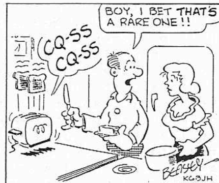
I took a break and went into the kitchen after the first 10 hours. As I made myself a piece of toast, I know I heard my toaster sending CQ SS (K17LP).