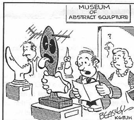
THIS IS CALLED "RADIO AMATEUR RESOLVING TVI PROBLEM WITH RECALTRANT NEIGHBOR"