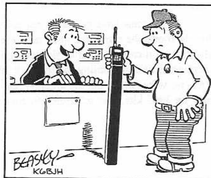
IT'S THE NEW BENTWOOD HT450 HANDHELD WITH THE "ALL-WEEK-LONG" BATTERY PACK.