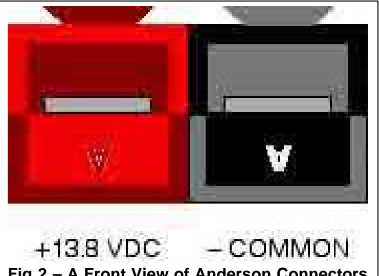
Fig 2 – A Front View of Anderson Connectors with RED 12V connector on left, when the front lip (contact-protector) is on the bottom of housing.