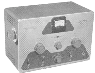
Heathkit DX-20. Many novices started with this 50W CW transmitter. The knob-like cover on the left pulled out to reveal the crystal socket.

ters since it detracted from their goal of improving their code to pass the General Class test.