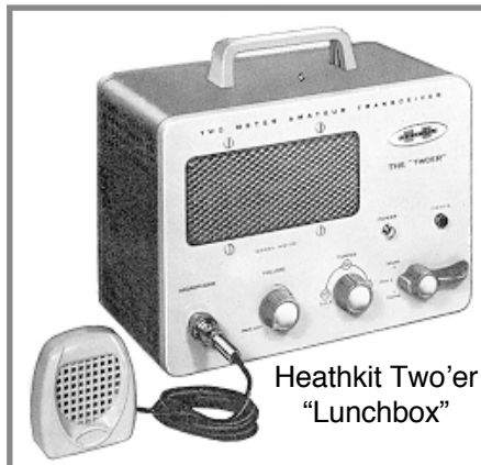
Heathkit Two'er "Lunchbox"

dropped. Thus WN6XXX was a novice call and became W6XXX after the General Class was obtained. When all the 'W' calls were taken in a call area 'KN' and 'K' were used instead. When they were used up things got a bit more complex and the 'WV' prefix was used for novices which became 'WA' upon upgrade.