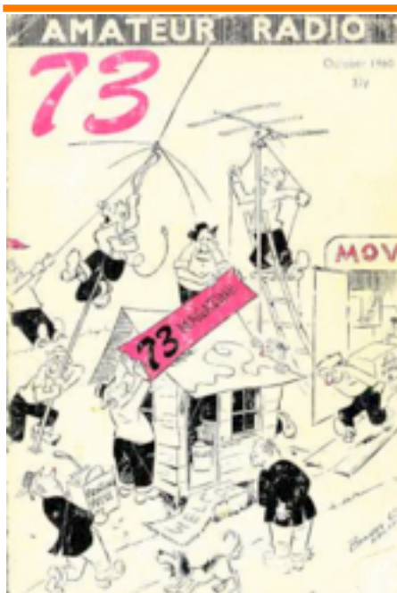
The first issue of 73 Magazine cover. See Page 5 for 73's demise.