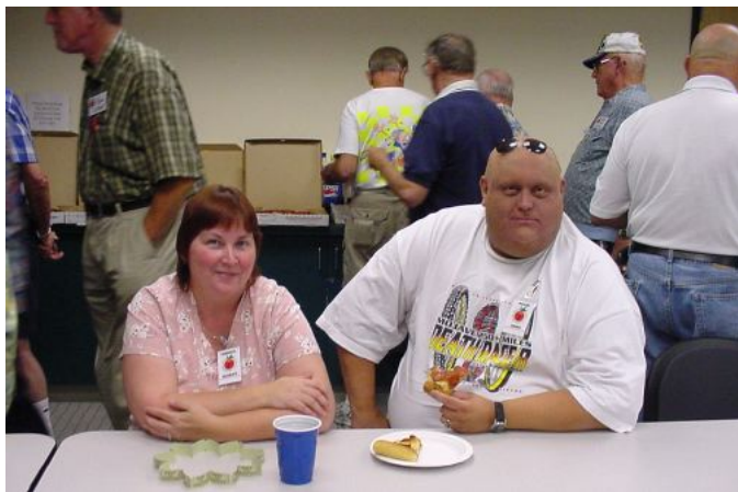
Members and guests load their plates with pizza and soda. Sorry, no there's no Sake nor Sushi! Join us for Field Day for those delights and lots of operating!