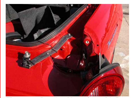
Figure 1 – Bracket Mounting with Rear Light Assembly Removed.

My plan was to "hide the holes" for mounting the metal bracket under the flaring of the rear light assembly on the T-Bird. Figure 1 show the bracket mounting area with the rear light assembly removed from the T-Bird.