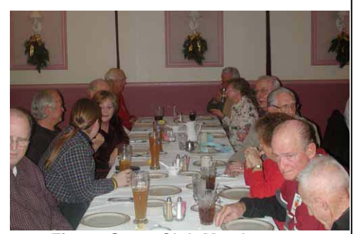
Fig 2 – Some Club Members at Table 2

We filled three long tables with club members and their guests. The German family-style was great.