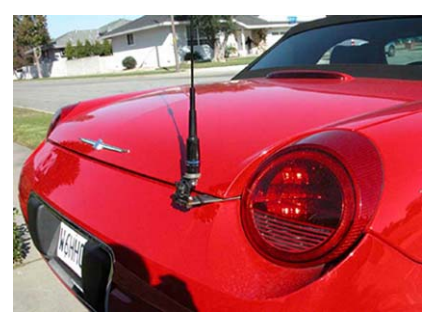
Figure 4 - Finished Mounting of Antenna on T-Bird.

ground plane under the antenna. The solution is to use "halfwavelength" antennas that do not require a ground plane for proper operation. This antenna model provides a half-wave on 144 MHz (36inchs long) and two collinear halfwaves on 440 MHz. The final results are that the antenna operates great and even fits under my garage door, too.