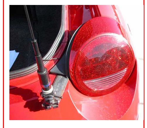
Figure 3 – Antenna Mounting Bracket with Rear Light Assembly Installed.

In Figure 3 you can see how the antenna mounting bracket looks with the rear light assembly reinstalled. There are no mounting holes visible after the rear light is installed. I am pleased to say I even received my wife's approval of "no holes showing".