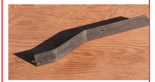
Figure 2 – Close-up View of Steel Mounting Bracket Shape.

Figure 2 shows a close-up of the final shape of the antenna mounting bracket.