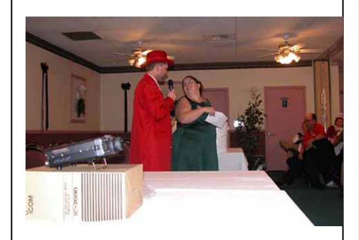
Fig 8 – And the Winner is....