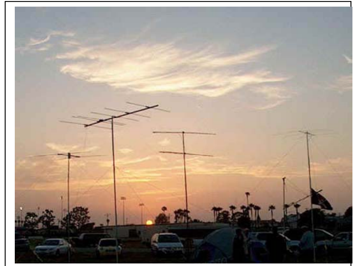
At the end of the day on Friday, the sun sets over the Pacific Ocean. The VHF/UHF antenna farm is silhouetted in this beautiful California sunset.