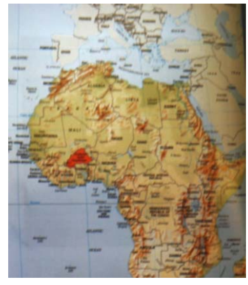
Burkina Faso is located just above the Equator

In case you have no idea where the country of Burkina Faso is located in Africa, see below: