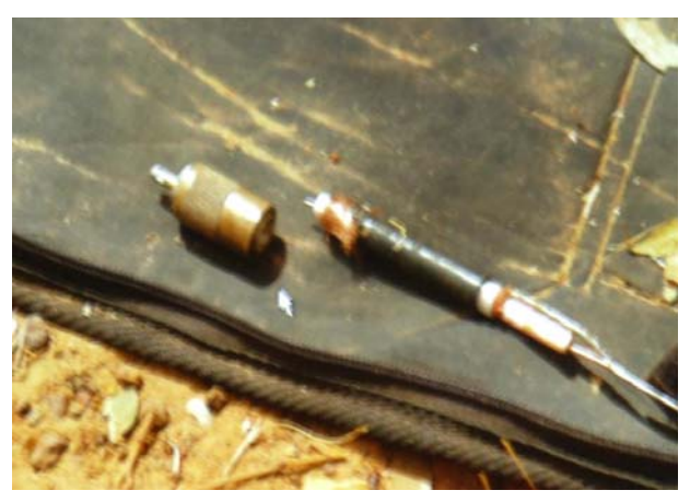
"The French Connection" Antenna Problem

labeled "The French Connection", seen below.