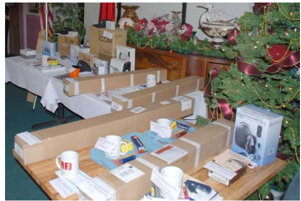
Fig 3 – A View of this Year's Raffle Prizes Organized by Dan N6PEQ....including the ICOM 756Pro3.