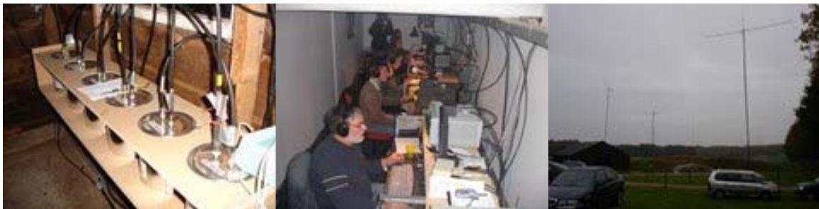
CQWW SSB 2007 PA6Z

Here are some pictures of the farmer's shed we renovated and turned into our clup operating station. It even has a bathroom (not shown)!