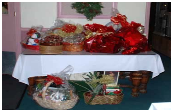
Fig 4 – This Year's Women's Raffle Prizes were Organized by Bev KI6APH

For the ladies, Beverly-KI6APH organized a terrific variety of ten different gift-baskets that were raffled off to the women attending the dinner.