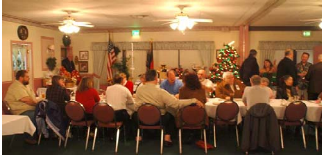
Fig 1 – OCARC had 51 Members, Spouses, Friends and Visitors attend the Holiday Party

The OCARC end-of-the-year dinner was another great success. We had what may be our greatest turn out of club members, spouses, and visitors for the holiday party!! And what tremendous prizes we had for both ladies and the die-hard radio operators!!