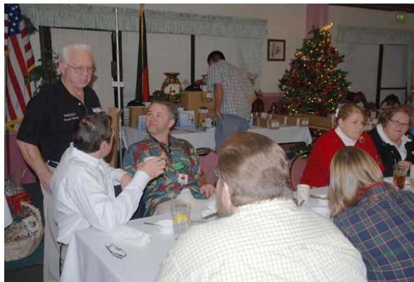
Fig 2 – The OCARC Christmas Party is always a time when Friends Gather to Relax