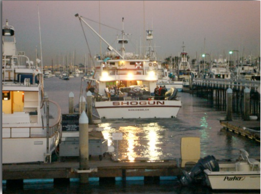
The Shogun departs from San Diego for Clipperton Island with twenty-one ham operators onboard.