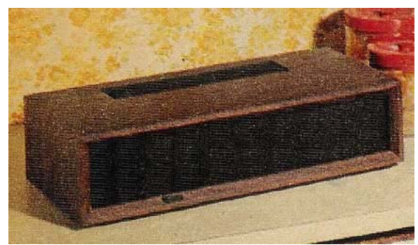
Heathkit GD-1298 Office

21-1/4 W x 10-5/8 and weighs about 19 pounds. It was designed for rooms up to 15' x 20'. The variable speed fan passes air through the filter at speeds up to 100 CFM. A washable foam pre-filter is used before the electrostatic filter, and an activated charcoal filter after it. The power supply produces 6,400 volts of ionizing voltage for the electrostatic filter. Following the tradition of the later portable units, no soldering was required for assembly.