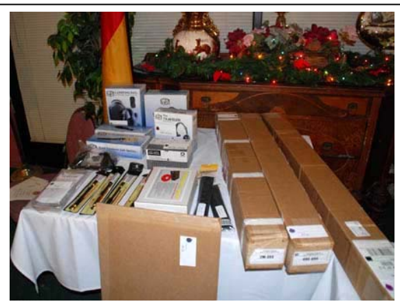
Just one of the tables of ham radio prizes to be won at the party.