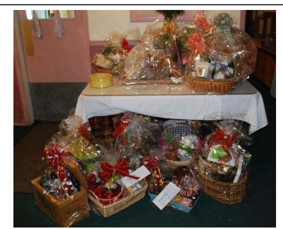
The prizes for Ladies were selected and nicely wrapped by Bev-KI6APH