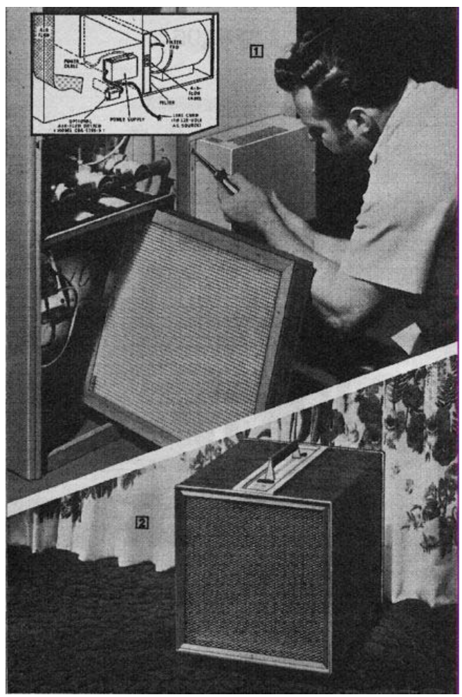
Top: The 1976 GD-1196 'In-furnace'. Bottom: The original GD-1003 'Portable'

Heathkit also dabbed in an office air purifier, the GD-1298. This smaller desk or shelf-top filter was introduced in the spring of 1984 for $199.95. This item evidently did not sell very well because in the fall of 1985 the price dropped to $99.95.