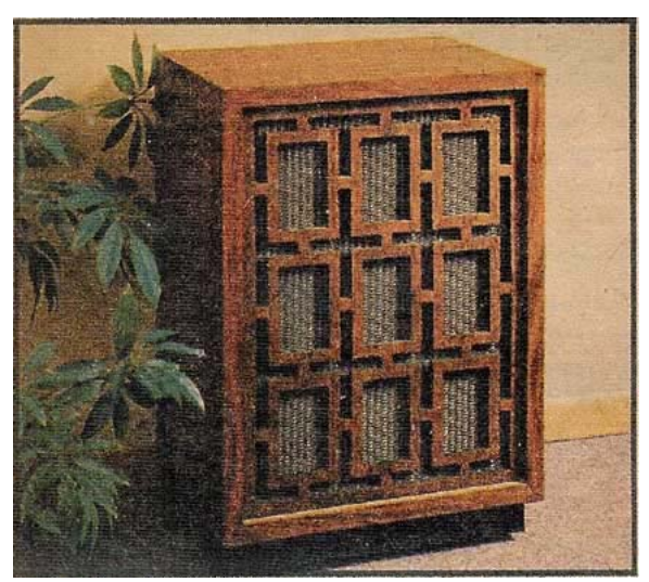
Heathkit GD-1297 Portable

cubic feet per minute ( CFM ). One feature of this kit mentioned in the catalog is that it requires no soldering. Instead, push-on terminals are used. Accessories for the GD-1247 were the deluxe caster set (GDA-1247-1 $8.95), and a replacement activated charcoal filter (GDA-1247-2 $5.95).