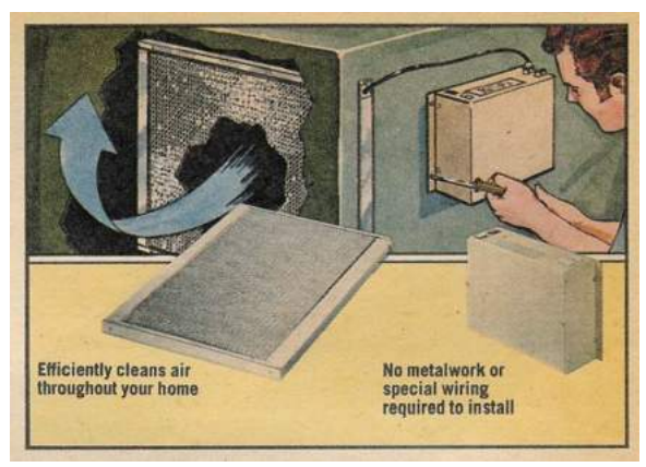
Heathkit Ad of the GD-2196 In-Furnace

ter six months to $149.95) was only the power supply and controller unit. The separate filter sold for $99.95 Two sizes were available: The GDA-2196-1 is 20" x 25" (1000 CFM), and the GDA-2196-3 is 16" x 25" (800CFM)