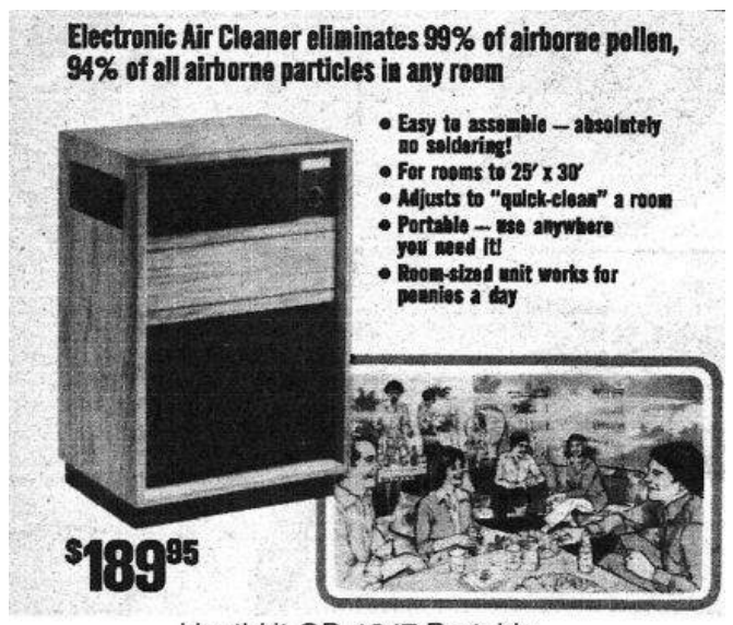
Heathkit GD-1247 Portable

the air passes into the first part of the electronic filter; here it passes between ionizing wires that are at a high positive voltage. Particles like dust and smoke acquire a strong positive charge as they pass through this stage. Next the air enters the second stage and passes through the collecting cell made up of numerous parallel metal plates. Alternate plates are at a positive voltage of about half the ionizing voltage, while the remaining plates are at ground potential. As the positively ionized particles pass between the collecting plates, they are repelled by the positive plates and attracted to the grounded plates where they are collected. The air is then often passed through an activated charcoal filter to remove any remaining odors.