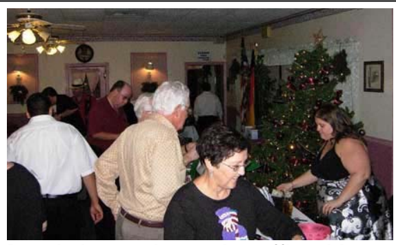
People hovered over the raffle table are appraising prizes and getting tickets.