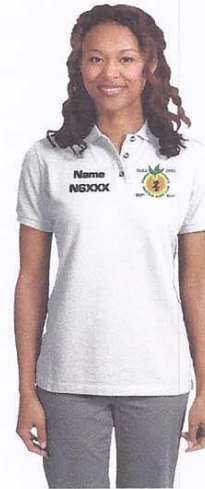
Port Authority® - Ladies Pique Knit Polo. L420

A favorite year after year, these polos are known for their exceptional range of colors, styles and sizes. The soft pique knit is shrink-resistant and easy to care for, so your group will always look its best.