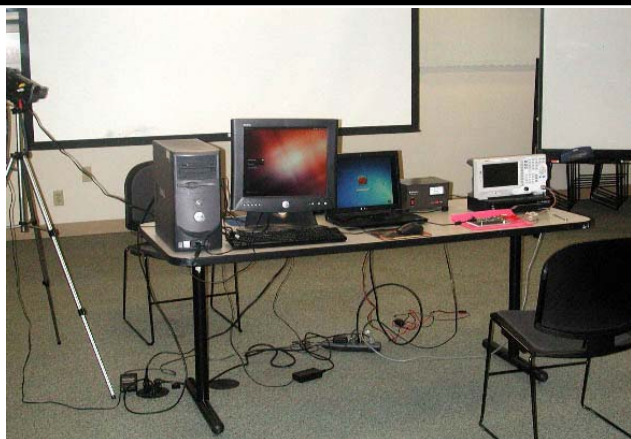
This is the DATV-Express demo set-up for receiving digital-ATV video

The next step for the project team is to get a larger group of testers using the latest version of the project board. Also, additional programmers are needed to complete aspects of the software. All in all, the DATV-Express project is heading for some exciting times.