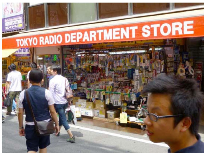
Fig 02: One of the many electronic stores in Akihabara. The store PA system announcements sometimes heard in Chinese language as there are frequent Taiwanese visitors. My hotel manager told me mainland Chinese visitors are being discouraged from visiting (by the Beijing government) due to the dispute over Senkaku/Diaoyu island.

travel agent suggested I could bring back up to $800 worth of gear without paying customs.