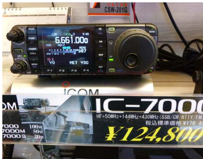
Fig 04: This Icom IC-7000 radio is set up for the Japanese VHF UHF bands. Note that the bands start at 144 and 430 MHz and may offer difficulty here in the USA. Look to the lower left and note also that this radio is offered in three versions of power output to provide for the license classes in Japan. It also is sold with a Japanese domestic warranty and I consider this version not attractive for purchase in Japan for use here in USA. It is also likely more expensive than offered by US Ham dealers.