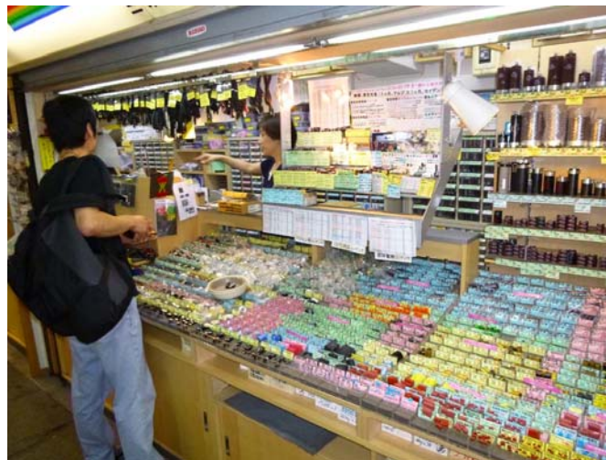
Fig 08: One of the many shops in the indoor swapmeet style of shops. This one specializes in capacitors.