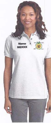
Port Authority® - Ladies Pique Knit Polo. L420

A favorite year after year, these polos are known for their exceptional range of colors, styles and sizes. The soft pique knit is shrink-resistant and easy to care for, so your group will always look its best.