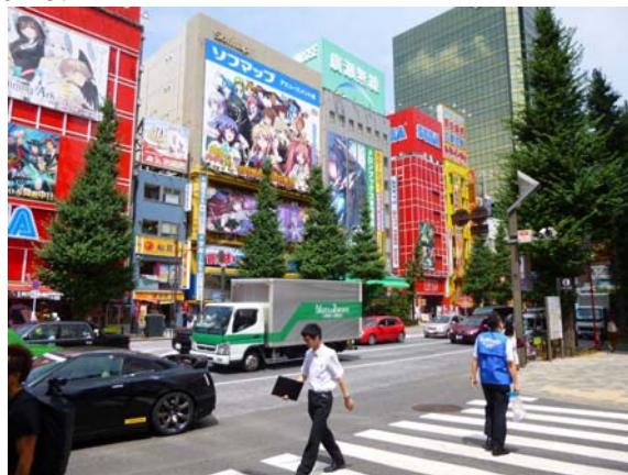
Fig 01: One of the main streets in Akihabara. Note the Anime and comic characters on the sides of buildings.

Since I last visited 27 years ago, Akihabara has developed into a center of Japanese otaku and anime culture, and dozens of stores specializing in anime, Manga, retro video games, figurines, card games and other collectibles which have filled the spaces between the electronics retailers. In addition to shops, various other animation related establishments have become popular in the area, and manga kissaten ("comics cafes"), a type of internet cafe where customers can read comics and watch DVDs in addition to having access to the internet.