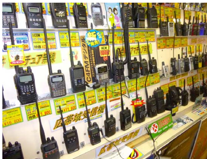
Fig 03: A wall of Handy Talkies, charming looking but most not attractive for purchase or use in the USA due to Japanese Ham bands 144/430 MHz installed. Perhaps some could be modified but it's not worth it. The instruction manuals may be in Japanese too.

Looking back on this, my regrets are not brushing up on my Japanese prior to travel. I hope to return to Japan next year to take in more of Tokyo and also see perhaps Osaka and Kyoto. As hams, if you decide on a trip to Tokyo try to time it with the Tokyo Hamfest also on the last week of August.