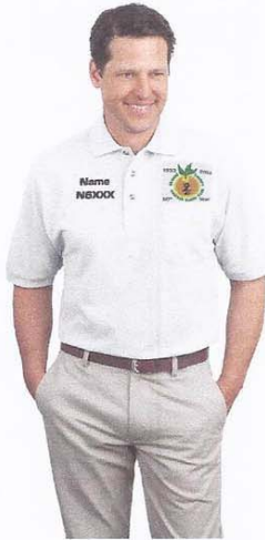
Port Authority® - Pique Knit Polo with Pocket. K420P

We garment washed our pique knit polo for softness and added a pocket for pens and more.