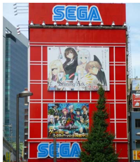
Fig 07: One of the typical buildings in Akihabara.