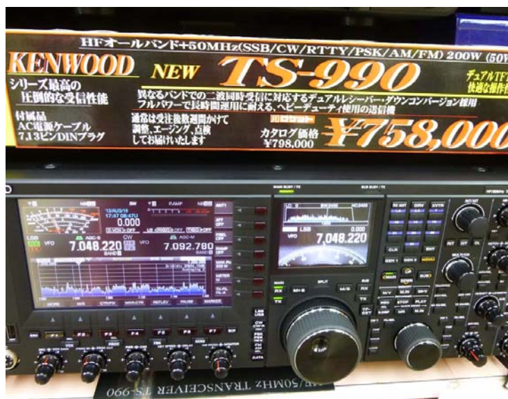
Fig 06: You are better off buying it in USA.