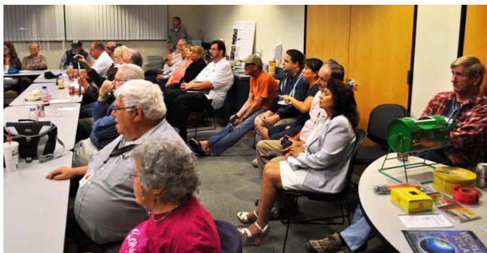
There was a great crowd with "standing room only"