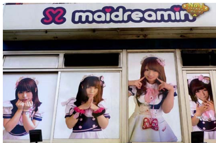
Fig 09: Maid cafe advertisement on side of building in Akihabara