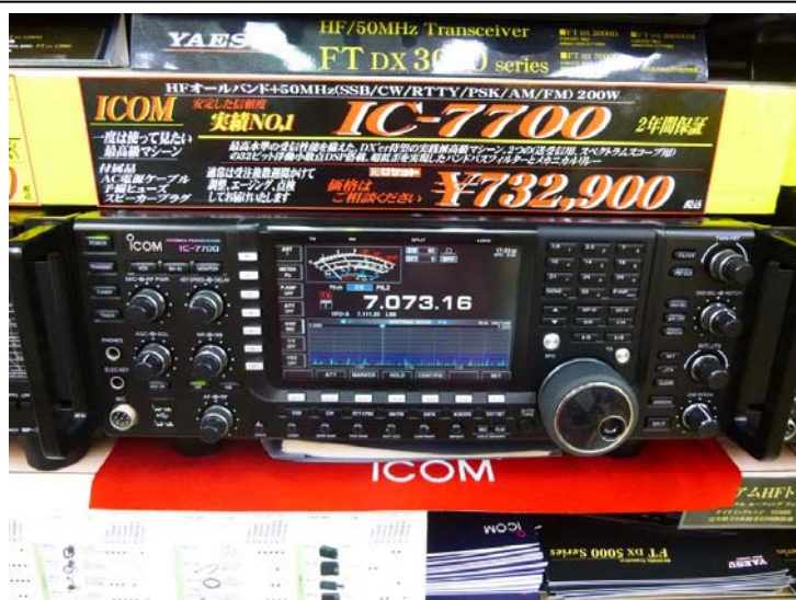
Fig 05: The IC-7700 is a good example of a radio ready for use in the USA. It has no Japanese banding issues since it is HF and 6 meters. It likely comes with an Instruction manual that has English and it is not a low power version. Only one BIG problem.....it costs $7,700 USD, about $1000 more than what you could buy one here in the states. Japanese only warranty also.