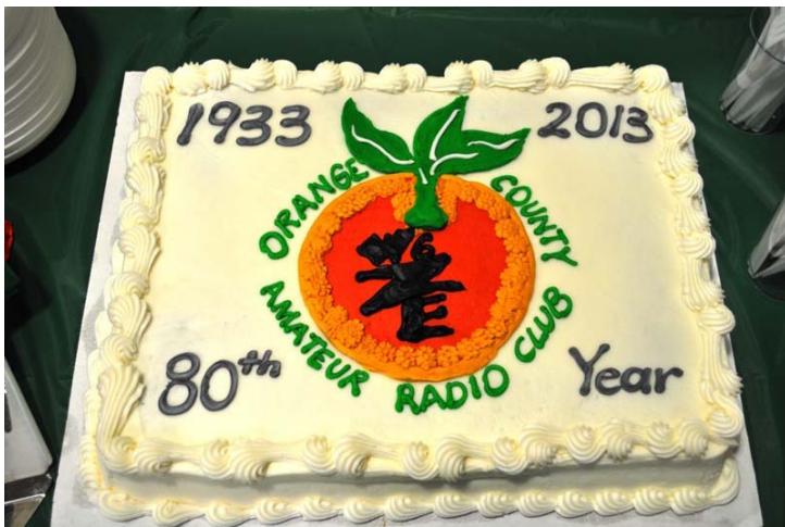
A very special-looking OCARC Anniversary cake was enjoyed by all