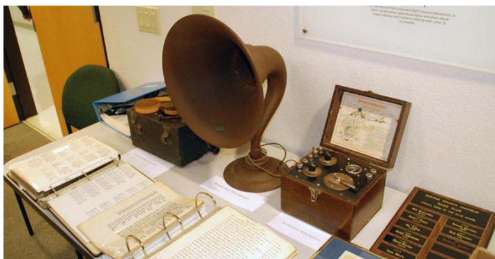
A long-ago "trumpet speaker", a one-tube radio, and OCARC historical records were on display