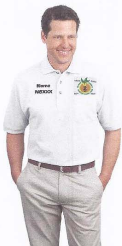
Port Authority® - Pique Knit Polo with Pocket. K420P

We garment washed our pique knit polo for softness and added a pocket for pens and more.