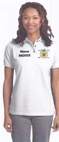
Port Authority® - Ladies Pique Knit Polo. L420

A favorite year after year, these polos are known for their exceptional range of colors, styles and sizes. The soft pique knit is shrink-resistant and easy to care for, so your group will always look its best.