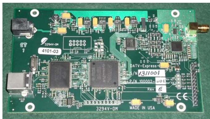
The new Board Layout (Rev E) used in the Pre-production Design

A short MPEG4 video of the pick-and-place robot in action can be found on the OCARC web site at: