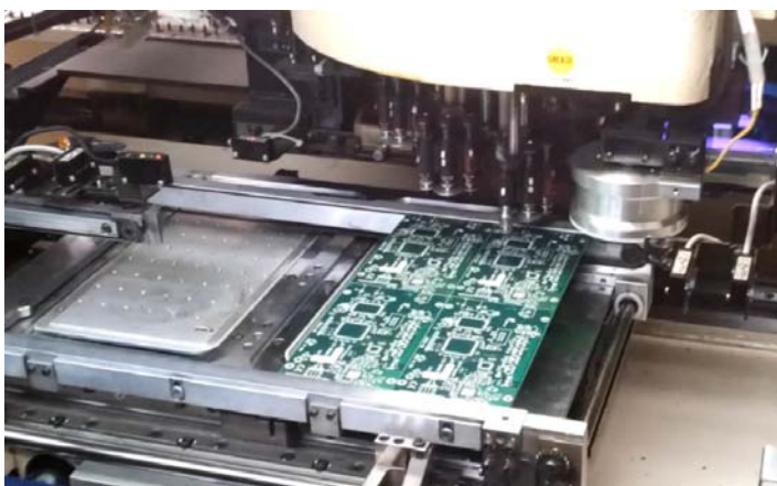
Pick-and-place robots place components down onto a panel of four DATV-Express boards

The blank PCBs are arranged as 2x2 arrays. The photo below shows the robot arm spinning to the right location in order to lower the SMT component onto the correct footprint...and the board array underneath shifts so that the arm can reach all four boards.