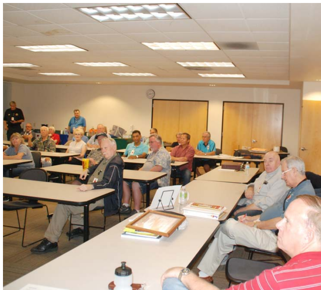
Well attended Anniversary Meeting