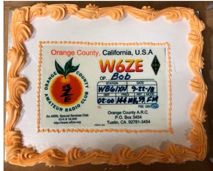
An Anniversary Cake commemorates the Bob Evans WB6IXN Lifetime Achievement Award.