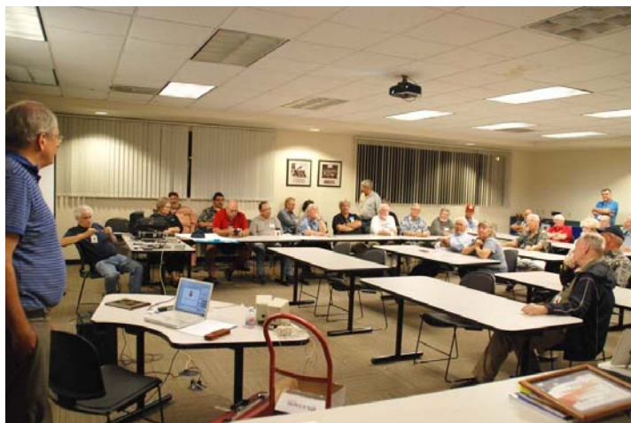
A lot of members told great stories of OCARC history and lore