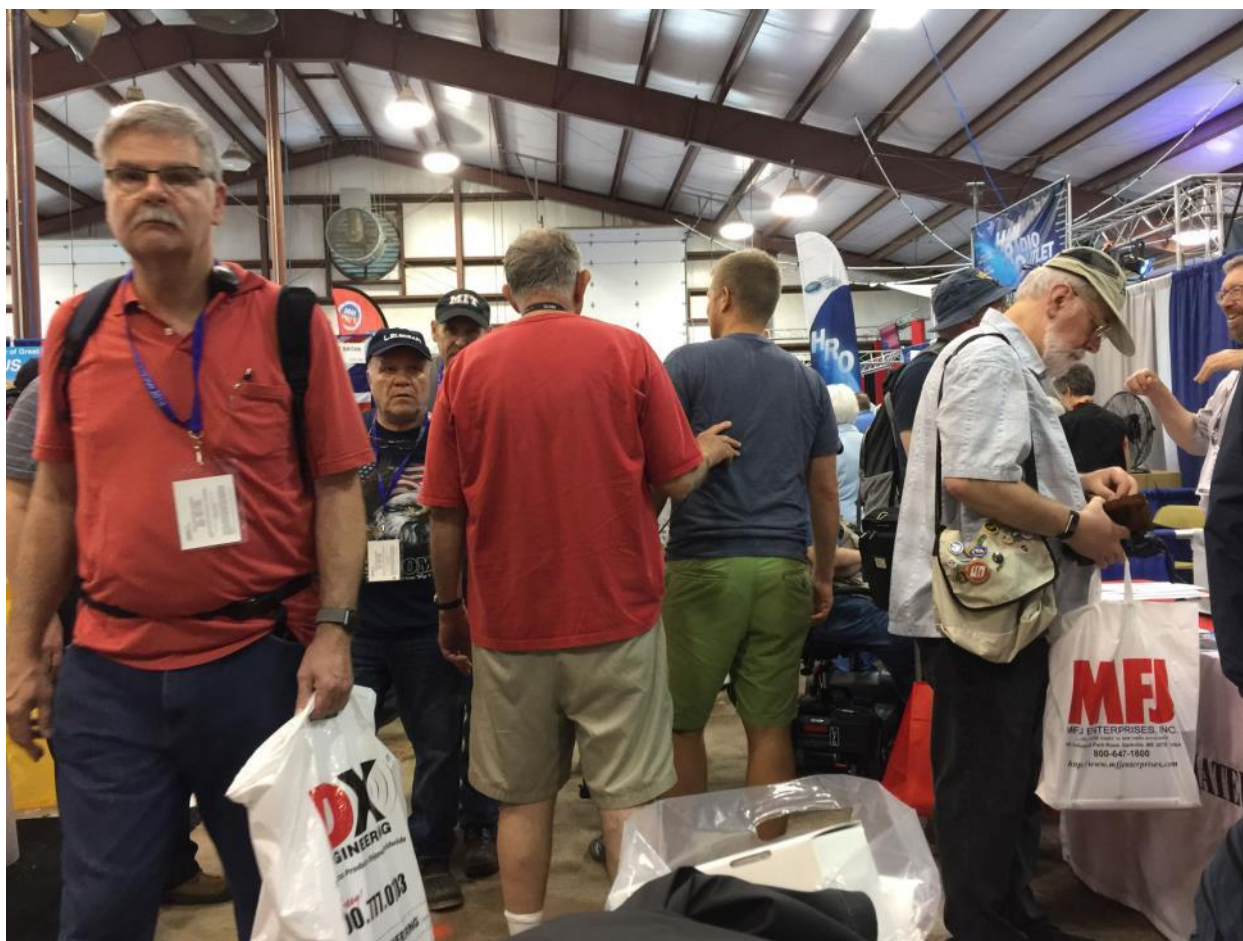
Walking in to the Main Arena.

But the major manufacturers such as Icom, Yaesu, Elecraft and Flex Radio were all well represented. At times but you might find yourself fighting for your space when dealing with a lot of people traffic, noise, interesting smells and at times rude, pushy, inconsiderate ya-hoo's.