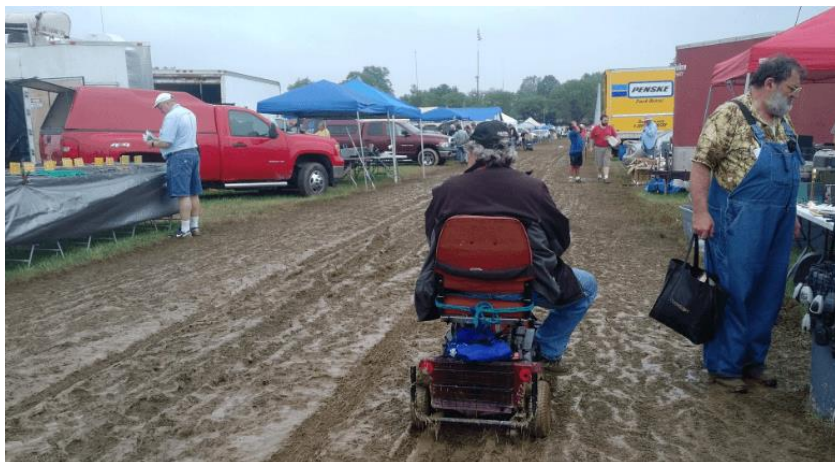
Muddy Flea Market.

The Dayton Hamvention has what I would call 'inside' and 'outside' exhibitors. Inside exhibitors would be defined as sellers inside the various steel buildings located within the paved areas and the 'outside' exhibitors, aka the Flea market would be those located obviously outside - within, on and around the grass or dirt horse race track area. Walkways to the Flea Market are primarily dirt. If it rains, as it can at times, the result to the pathway's mean it becomes a muddy mess. This occurred at least once while we were there.