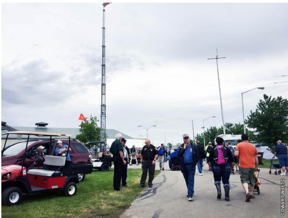
View once through the entrance gate

I read that previous attendee's reviews that mentioned parking is a nightmare. Frankly it wasn't so bad for us. It rained briefly a few times while we were there. I was able to park in a grass field adjacent to the Fairground's entrance. When we arrive somewhat early there were many volunteers helping to direct cars. Be on the lookout for muddy patches here and there. If really rained for a period of time it might be a real challenge. We made it a point to arrive well ahead to the time the Event was to open, which in turn made parking a lot easier and provided a location that is closer to the Hamvention entrance and the scooter rental tent.