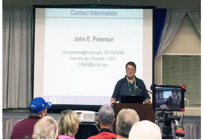
Information conference inside small structure