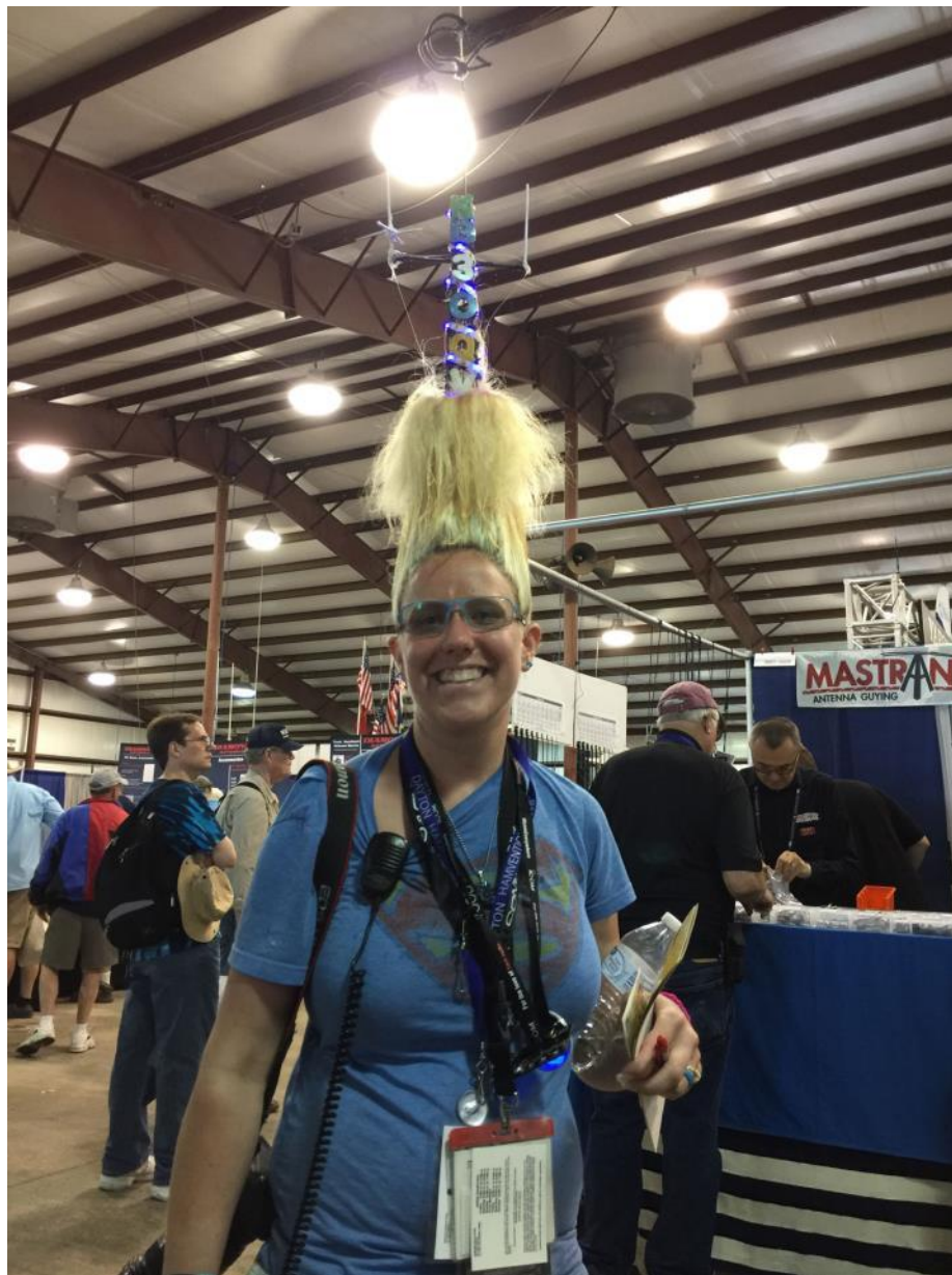
Dressing Up!

Attire: Come with clothing that is comfortable to wear and walk in. I carried a poncho with me just in case of rain. A few select attendees went the extra mile to dress for the occasion (see image below).