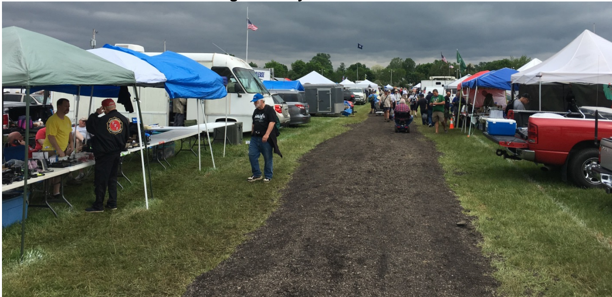
Flea Market.

The Flea Market reminds me of a swap meet. In comparison it's in some ways similar to the TRW swap meet yet it held on grass or dirt with dirt pathways but a 100 times bigger perhaps! Pouring rain would be a disaster for sellers and for buyers alike. Unfortunately this has happened during a previous Hamvention with flooding the Flea Market following an unexpected downpour. I believe it was on the 2 nd day that a sudden severe thunderstorm approached the Event and organizers began to announce on their PA's to immediately evacuate the grounds and the Flea Market area into the steel building and out from being in the open. It just took minutes for the larger buildings to become standing room only until the storm passed. Those of us from the west coast, especially California don't often get this type of excitement! In conclusion the Flea Market was interesting and fun but disappointing also. Initially there's a lot of expensive junk and even more expensive good stuff. You can expect to bargain to drive the costs down but most real bargaining didn't happen until the last day of the Event.