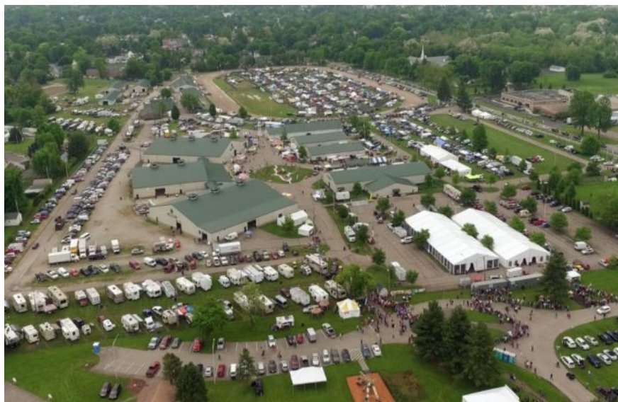
Aerial view of the Fairgrounds.

Background: My adventure began more than 5 years ago. Like many Amateur radio OP's I got bit by the 'Dayton Bug' when I heard stories and saw advertisements of the wonders of the Hamvention. I've been to other various local Ham swap meets and regional conferences but the thought of going to the big Granddaddy of all the 'Dayton Hamvention' meant that all my dreams would come true! When I finally made a serious decision to take the time and spend the monies to go I began to take action.