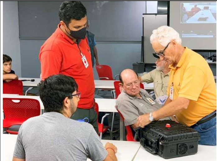
Nicholas AF6CF demonstrating the features of his portable battery box.