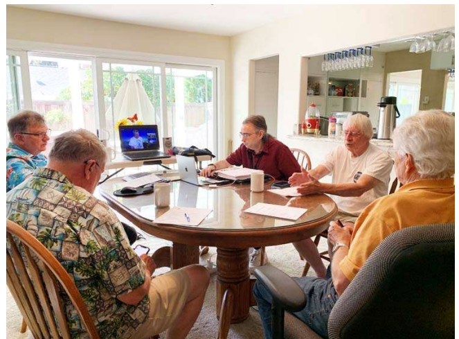
Behind the scenes: July Board of Directors Meeting at W6ETC QTH