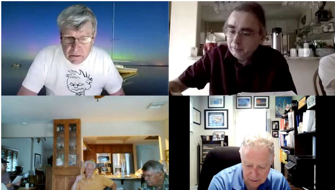
Two board members attended via Zoom