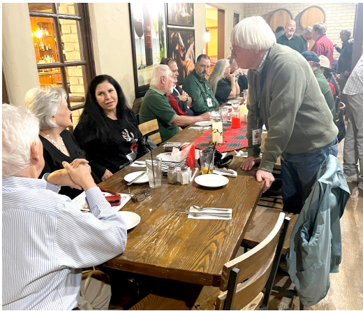
Guests gathered early at Mimi's Café. This is one of two tables at the packed attendance this year.