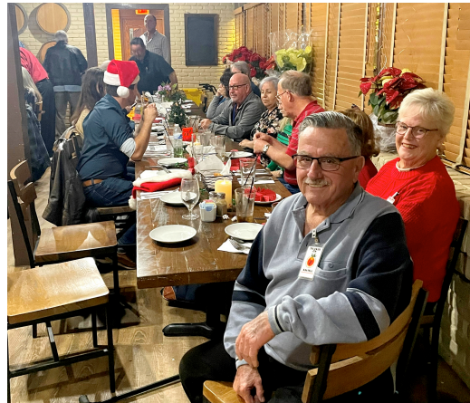
Guests and members also filled a second table. The choice of four entrees ensured everyone had a tasty dinner.