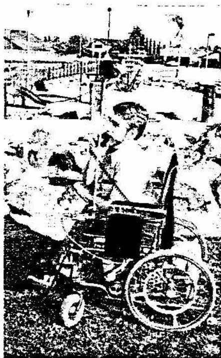
The author operates his converted CB radio on 10 meters. The rig and antenna are mounted on the left arm of his motorized wheelchair.

I call my project "The Handicapper's Special" because of the special ways that a mobile CB radio can be converted and modified for 10-meter operation. Depending on the type of CB you have, you can convert it to 10 meters with very little trouble.† An ssb CB radio can be set up to operate a-m, fm, ssb or even cw. [Editor's Note: Any CB that has ssb capability should be adaptable to cw. The newer 40-channel types, because of the PLL, are