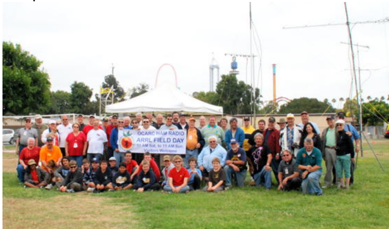
OCARC 2013 Field Day Group placed 2nd overall with 6,859 QSOs

In early January we participate in Winter Field Day operating in an outdoor class, and the club has finished first place overall in 2019 and 2020.