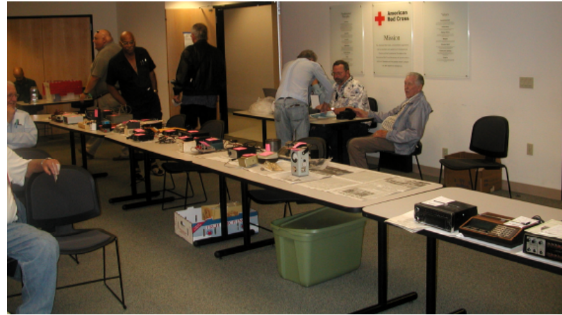
Just part of the items for auction at the annual October auction.

In October the club holds an open auction for selling and buying amateur radio and amateur radio related items: