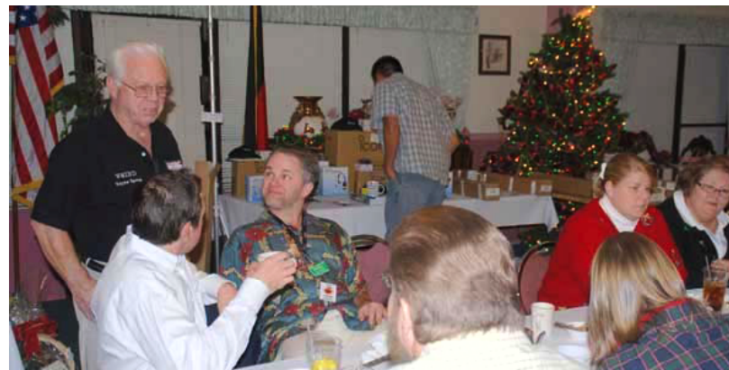
Our annual Holiday dinner and party.

In December there is the yearly club Holiday Dinner Party :