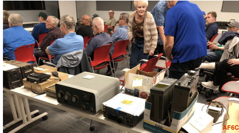
Lots of goodies and bidders at the 2024 annual October auction. AF6C

In October the club holds an open auction for selling and buying amateur radio and amateur radio related items: