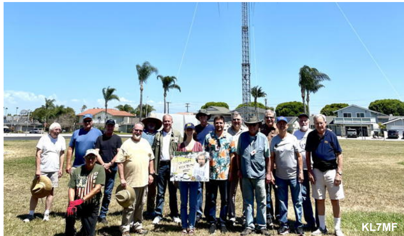
Remainder of OCARC's ARRL Field Day Group, after Sunday teardown. KL7MF

In late January we participate in Winter Field Day operating in an outdoor class, and the club has finished first place overall numerous times.