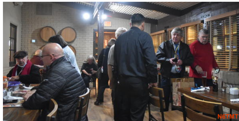
Club members gather for the 2024 Holiday Dinner Party. N6TMT

In December there is the yearly club Holiday Dinner Party :